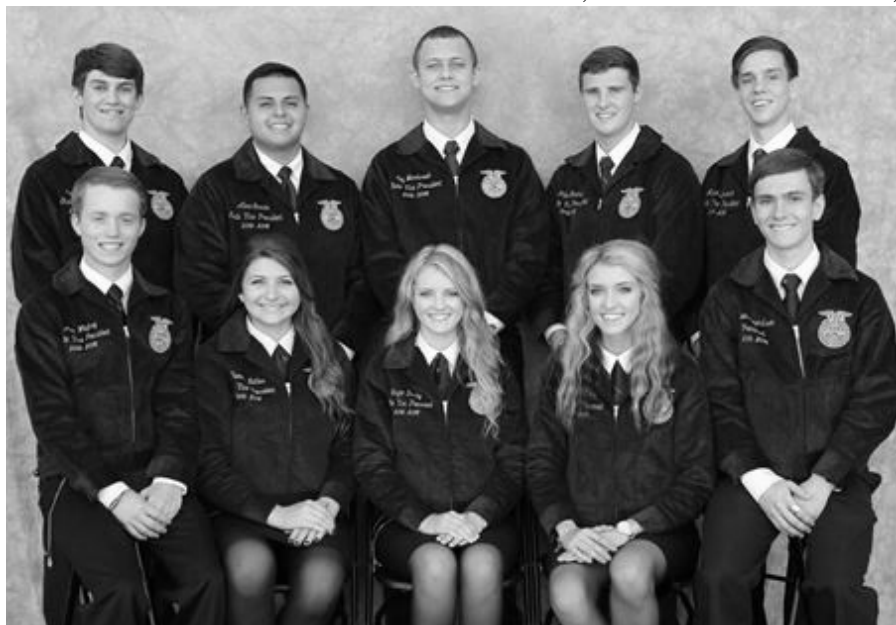
2015-2016 Texas FFA Officers

Section 3: Executive Board The Texas FFA Association's executive board includes the chairman of the board of directors, the executive directors of the Texas FFA Association, Texas FFA Foundation, Vocational Agriculture Teachers Association of Texas, the CTE Statewide Coordinator for Agriculture, Food and Natural Resources, and the state FFA president or another designated student officer. The executive board interprets policy and renders decisions deemed to be more than a management decision, handles appeals and other administrative matters presented by the executive director.