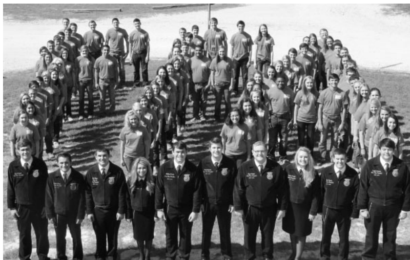
The 2015 State Leadership Conference was held at the Three Mountain Retreat near Clifton, June 7-9, 2015.

Ford Leadership Scholars In September, 2009, the Texas FFA Board of Directors approved the Ford Leadership Scholars, a cutting- edge leadership development program. An application process begins in January and includes a reading assignment, test, telephone interview and finally a face-to-face behavioral interview. Ten members are selected by a committee of industry professionals to participate in an intense six-month program that includes industry tours, hands-on projects and mentoring by recognized industry leaders.