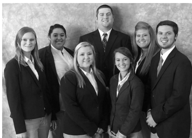
2015-2016 Texas Collegiate FFA Officers -