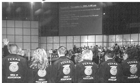
Texas FFA members have an opportunity to exert influence on a national scale, not only as delegates, but also via a grassroots process through which any member can have an submit an issue and possibly have it debated and discussed by national delegates.

National Convention Delegates Each state FFA association is allotted a number of voting delegates to the National FFA Convention based on membership. Each state FFA Association is allotted a number of voting delegates to the National FFA Convention based on membership. In 2015, 67 of the 475 national delegates are Texans. The state's ten-member officer team serves as part of the delegation and the area associations are given the opportunity to select members to travel to the national convention to represent the interests of the state's members in conducting the National FFA Organization's business. The national delegate process starts long before the national convention. In Texas, It begins as a grassroots process through which any member has the opportunity to have an issue or idea considered at the national level. One of an area officer's first responsibilities is to gather concerns and issues regarding the National FFA Organization. These are funneled to the state leadership conference in June, at which time a student national issues committee examines all forwarded issues and submits a report to the Texas FFA Board of Directors and to the National FFA Organization. These issues, along with other issues forwarded by other states are considered by the delegates to the National State President's Conference in Washington, D.C. Issues deemed to be most important are selected and become